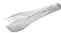
Molla a servire Serving tong Servierzange Pince à servir Pinza para servir