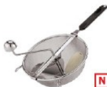
Passaverdura, inox Vegetable sieve, stainless steel Passiergerät, Edelstahl Rostfrei Mini heche-tout, inox Pasa verdura, inox