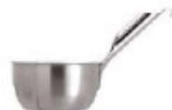
Tazzone con manico e gancio, inox Kitchenbowl with handle and hook, s/s Schlagschüssel mit Rohrstiell u. Haken Bol avec manche et crochet, inox Cazo bombeado con gancho, inox