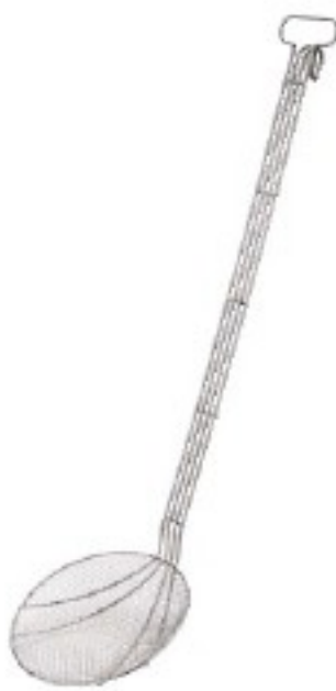
Schiumarola fish & chips, inox Skimmer fish & chips, s/s Fritierschaumlöffel, Edelstahl Rostfrei Ecumoire, inox Espumadera para pescado, inox