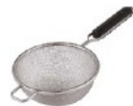
Colapasta doppia rete, inox Strainer, double mesh, s/s Passiersieb, doppelnetz, Edelstahl Passoire, maille double, inox Colador doble red, inox