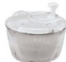
Centrifuga per insalata Salad spinner Salatschleuder Essoreuse manuelle à salade Secador manual para verduras