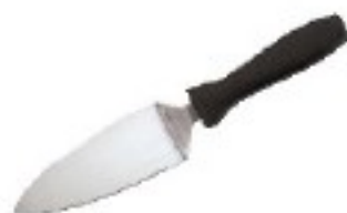
Spatola dolce Pastry spatula Kuchenpalette Palette à pâtissier Espátula dulces