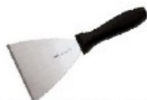
Spatola triangolare Cleaning spatula Bratenspachtel Spátule Espátula triangular

art. dim. cm. 18520-04 12x4 18520-06 12x6 18520-08 12x8 18520-10 12x10 18520-12 12x12