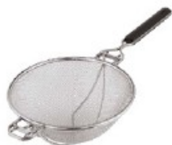
Colapasta rinforzata, inox Strainer, reinforced, s/s Grosskuchensieb mit Verstärkung, E. R. Passoire renforcé, inox Colador reforzado, red inox