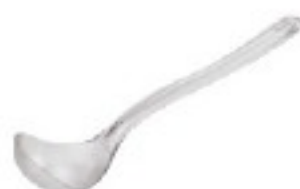
Mestolo per sangria Sangria ledle Sengrialöffel Louche à sangria Cucharón para sangría