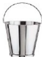
Secchiello graduato con base, inox Graduated bucket with bottom ring, s/s Eimer mit Fuss u. Skala, Edelstahl Seau gradué avec base, inox Cubo con medidas y base, inox