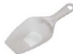
Sessola Flour scoop Mehlscheffel Pelle à farine Pala para harina

art. lit. 14959-01 0,10 14959-02 0,25 14959-05 0,50 14959-10 1,00 14959-20 2,00