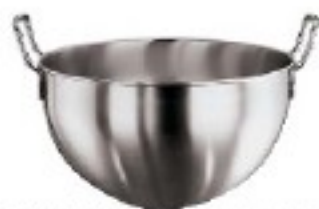
Bastardella semisferica, inox Mixing bowl, stainless steel Schneeschiägkessel, Edelstahl Rostfrei Bassine hémisphérique, inox Caldero con asas, inox