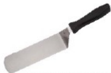
Spatola hamburger Hamburger turner Bratenwender Grand palette Espátula hamburger

art. dim. cm. 18520-04 12x4 18520-06 12x6 18520-08 12x8 18520-10 12x10 18520-12 12x12