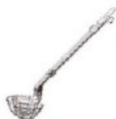
Colafritto, inox Bird nest fryer, s/s Nestbacklöffel, Edelstahl Rostfrei Nid à friture, inox Colador para fritura, inox