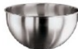
Bastardella senza maniglie, inox Mixing bowl without handles, s/s Schneeschlagkessel ohne Griffe, E. R. Baccine hémisphérique sans ances, inox Caldero sin asas, inox