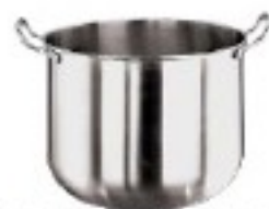
Bacinella per planetaria, inox Kettle for mixing machines, s/s Schlagmeschinenkessel, Edelstahl Bol pour mélangeurs, inox Caldero para batiders, inox