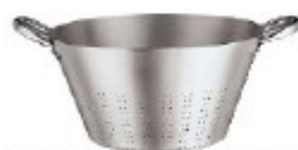
Colapasta tronco conico, alluminio Conical colander, aluminium Gemüsesieher, Aluminium Passoire à légumes, alu Colador cónico, aluminio