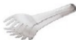
Molla spaghetti Spaghetti tong Spaghettizange Pince à spaghetti Pinza espagueti