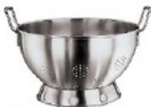
Colapasta con cerchio, inox Colander, stainless steel Gemüsesieher, Edelstahl Rostfrei Passoire à légumes, inox Colador con base, inox