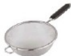
Colino a rete, inox Soup strainer, s/s Suppensieb, Edelstahl Rostfrei Passe-bouillon, inox Colador a red, inox