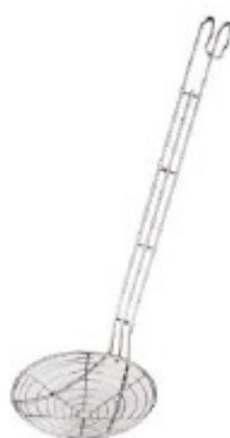
Schiumarola a filo inox Skimmer, stainless steel Drahtlöffel, Edelstahl Rostfrei Ecumoire, inox Espumadera a filo, inox