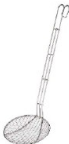
Schiumarola a filo inox Skimmer, stainless steel Drahtlöffel, Edelstahl Rostfrei Ecumoire, inox Espumadera a filo, inox