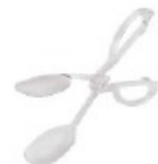
Forbice per pane e dolci Bread and pastry plier Brot u. Gebäckzange Pince à pain et pâtisserie Pinza pan y pasteles