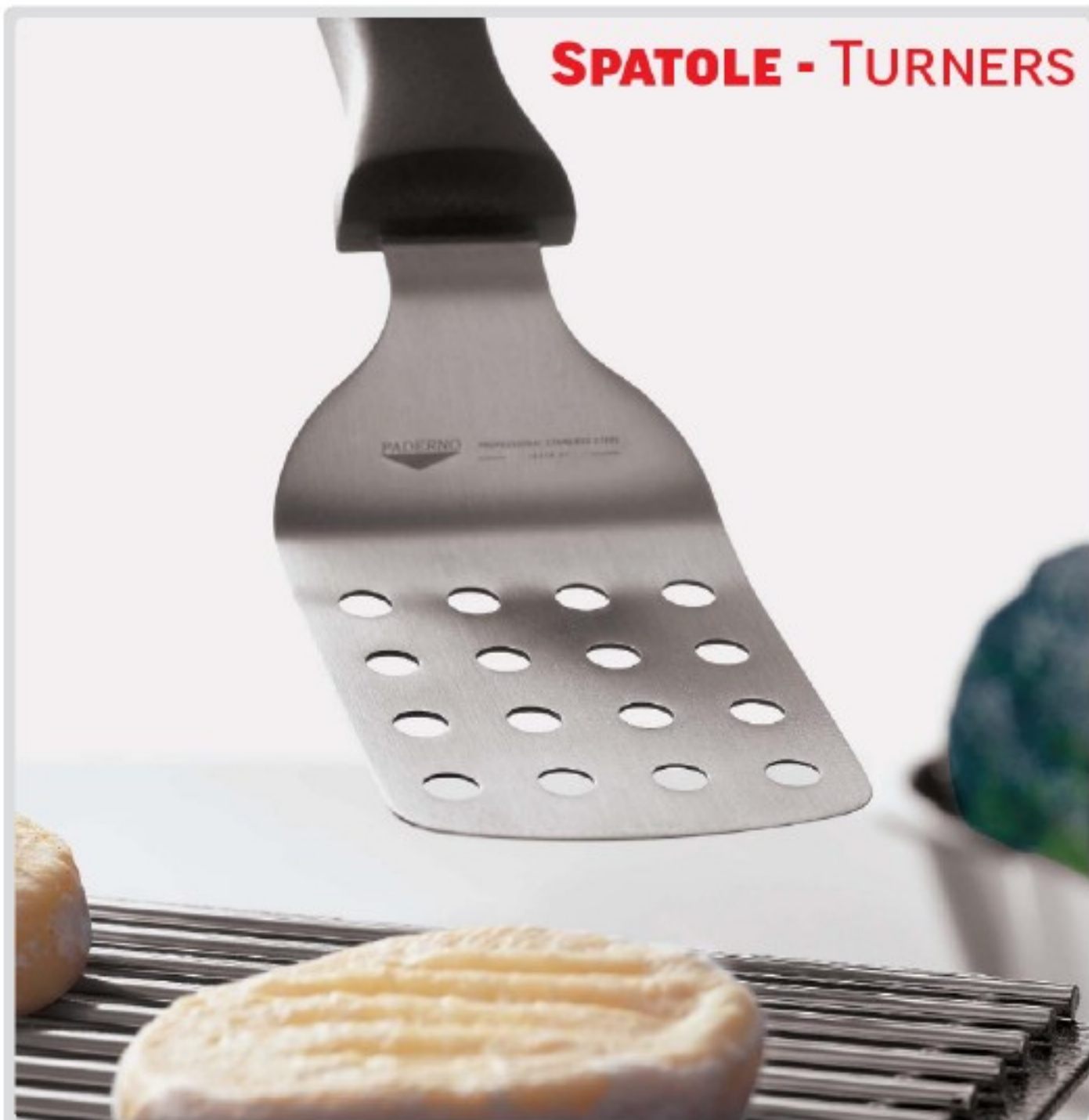
Spatole in acciaio inox con manice in polipropilene.