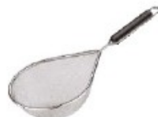
Coletutto, inox Strainer, s/s Sieb, Edelstahl Rostfrei Passoire, inox Colador multiuso, inox