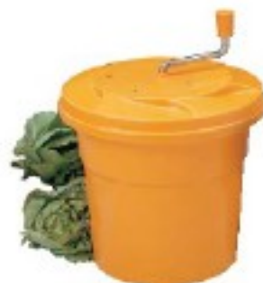
Centrifuga manuale per verdura Manual salad spinner Salatschleuder Essoreuse manuelle à salade Secador manual para verduras