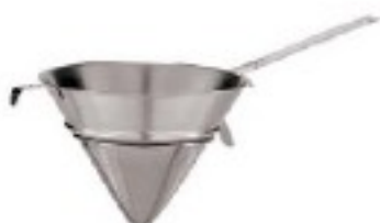
Cornetto c/protezione, inox Chinese colander with wire protection, s/s Spitzsieb mit Verstärkung, Edelstahl Chinois à gaze avec renfort, inox Colador chino con protección, inox