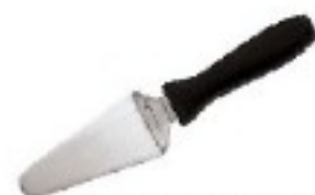
Paletta dolci Pastry spatula Gebäckpalette Palette à gâteau Paleta dulces

art. dim. cm. 18519-15 15,5x3 18519-22 22x3,4 18519-26 26x3,7 18519-30 31x4,3 18519-35 36x5