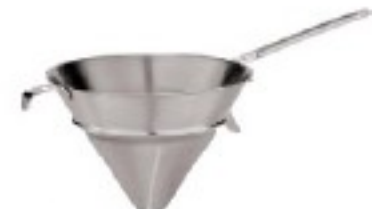
Cornetto cinese a rete, inox Colander with wire gauze, s/s Gazensieb, Edelstahl Rostfrei Chinois à gaze, inox Colador chino a red, inox