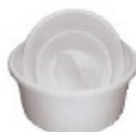
Bacinella tonda, PE Mixing bowl, PE Schüssel, PE Baccina tonda, PE Caldero semiesférico, PE