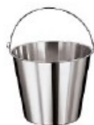
Secchiello graduato, inox Graduated bucket, stainless steel Eimer mit Skala, Edelstahl Rostfrei Seau gradué, inox Cubo con medidas, inox