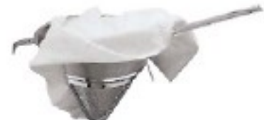
Panno passabrodo Bouillon cloth Bouillonstoffsieb Etamine passe-bouillon Paño para pasar caldo