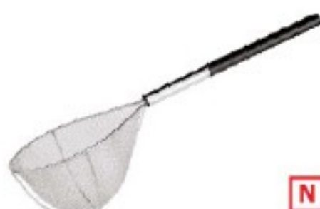
Colatutto gigante, inox Strainer, stainless steel Grosskuchensieb, Edelstahl Rostfrei Passoire étamé, inox Colador multiuso gigante, inox