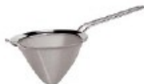
Colino conico a rete, inox Chinese soup strainer, s/s Suppen-Spitzsieb, Edelstahl Rostfrei Passe-bouillon chinois, inox Colador cónico a red, inox