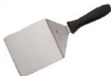
Spatola hamburger Hamburger turner Hamburgerspachtel Palette à hamburger Espátula hamburger