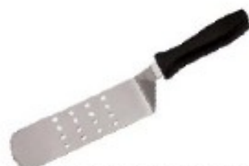
Spatola hamburger, forata Perforated hamburger turner Bratenspachtel, gelocht Grand palette perforée Espátula hamburger perforada