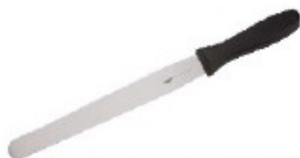
Spatola cuoco Spatula Palette Palette Espátula chef

art. dim. cm. 18518-22 22x3,4 18518-26 25x3,7 18518-30 30x4,3