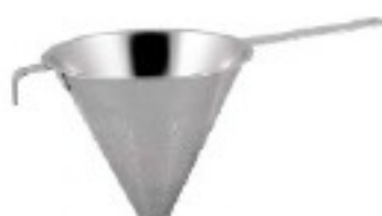
Cornetto cinese, inox Chinese colander, s/s Spitzsieb, Edelstahl Rostfrei Passoire chinois, inox Colador chino, inox