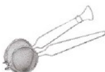
Colafritto, inox Bird nest fryer, s/s Nestbacklöffel, Edelstahl Rostfrei Nid à friture, inox Colador para fritura, inox