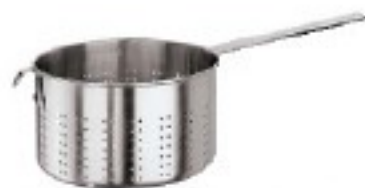
Colapasta, inox Strainer, stainless steel Stielsieb, Edelstahl Rostfrei Passoire, inox Colador, inox