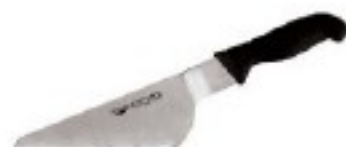
Coltello lasagne Lasagne knife Lasagnemesser Couteau à lasagne Cuchillo lasagne