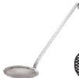
Schiumarola a rete pascabroda, inox Mesh skimmer, s/s Schaumlöffel, Edelstahl Rostfrei Ecumoire, inox Espumadera, inox