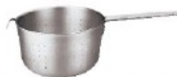
Colapasta, alluminio Strainer, aluminium Stielsieb, Aluminium Passoire, elu Colador, aluminio