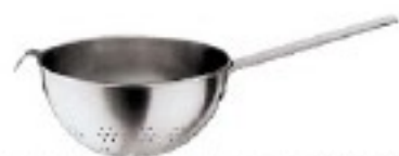
Colapasta semisferico, inox Strainer, stainless steel Stielsieb, Edelstahl Rostfrei Passoire hémisphérique, inox Colador semiesférico, inox