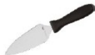
Coltello torta Pie knife Tortenmesser Couteau à gâteau Cuchillo pasteles