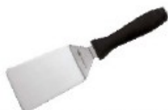
Spatola per pasticcio e pizza Pizza turner Pizzawender Palette à pizza Espátula pizza