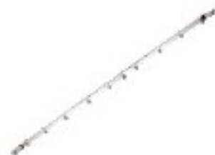
Acta, inox Wall rack, stainless steel Aufhängungstange, Edelstahl Rostfrei Triangle de cuisine, inox Acta para utensílios, inox