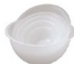
Bacinella tonda, PP Mixing bowl, polypropylene Schüssel, Polypropylen Baccina tonda, polypropylene Caldero semiesférico, PP