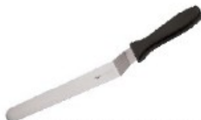
Spatola cuoco con scalino Angular spatula Confiseriepalette Palette coudée Espátula chef angular

art. dim. cm. 18518-22 22x3,4 18518-26 25x3,7 18518-30 30x4,3