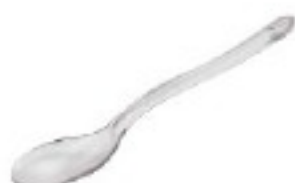
Cucchiaione Spoon Löffel Cuillère Cuchara