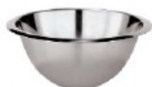
Bacinella semisferica, inox Hemispherical mixing bowl, s/s Schüssel, Edelstahl Rostfrei Bassine demi-ronde, inox Caldero semiesférico, inox