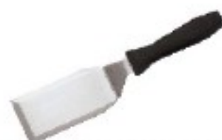
Spatola lasagne Lasagne spatula Lasagneheber Palette à lasagne Espátula lasagne