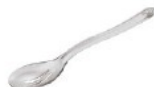
Cucchiaione forato Perforated spoon Löffel gelocht Cuillère percée Cuchara perforada