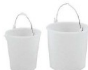
Secchio graduato, plastica Graduated bucket, plastic Eimer mit Skala, Plastik Seau gradué, plastique Cubo plástico