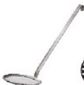
Schiumarola a rete stirata, inox Mesh skimmer, s/s Schaumlöffel, Edelstahl Rostfrei Ecumoire, inox Espumadera, inox