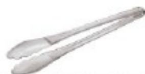
Molla concava Utility tong Servierzange Pince à servir Pinza para servir